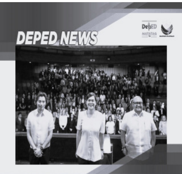
VP SARA EXPRESSES GRATITUDE TO DEPED PARTNERS' SUPPORT IN REALIZING MATATAG AGENDA

Vice President of the Philippines and Secretary of the Department of Education (DepEd) Sara Z. Duterte on Tuesday recognized the agency's partners for their invaluable contribution and support to realizing the MATATAG Agenda.